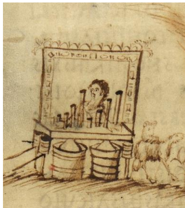
Figure 1: Pipe organ in 9th century psalm illustration.

As shown in Figure 1 below, pipe organs were small, and even portable pipe organs existed.