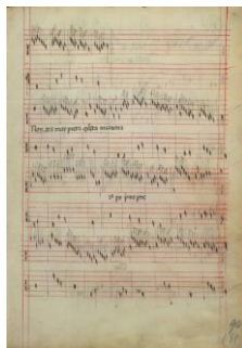
Figure 2: Faenzai 117. Kódex [15].

The original layer of the Codex Faenza is a 14th-century vocal adaptation. As shown in Figure 2 below, the original layer contains eight lines of music per page, recorded using "mensural notation" (black and red notes). The musical compositions in the second layer of the Codex Faenza have been hypothesized to be songs from the Lucca region in 1467-73. The second level of the Codex Faenza is transcribed in white quantitative notation, an Italian notation for the organ. The notation consists of two melodic lines connected by bar lines. The bass part of the melody is on the bottom, and the discantus part is on the top.